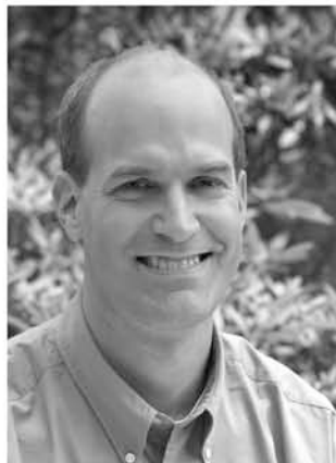
Rep. Rick Larsen U.S. Congress, WA-2nd District